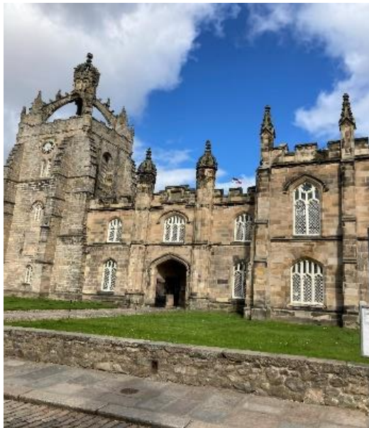
(King's College)