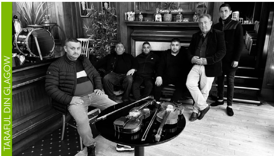
TARAFUL DIN GLAGOW