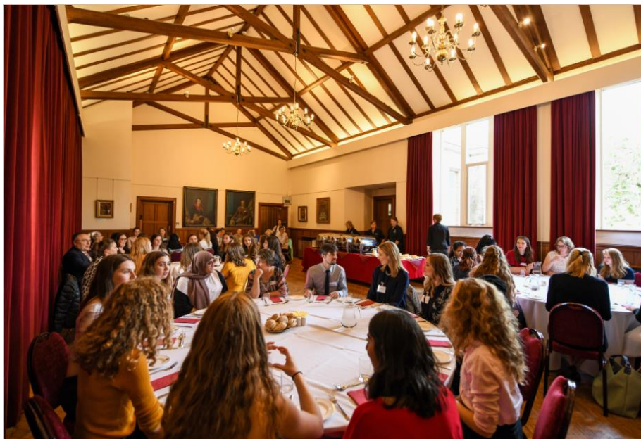
Diagram 2: Pictures from Women In Engineering Conference 2018