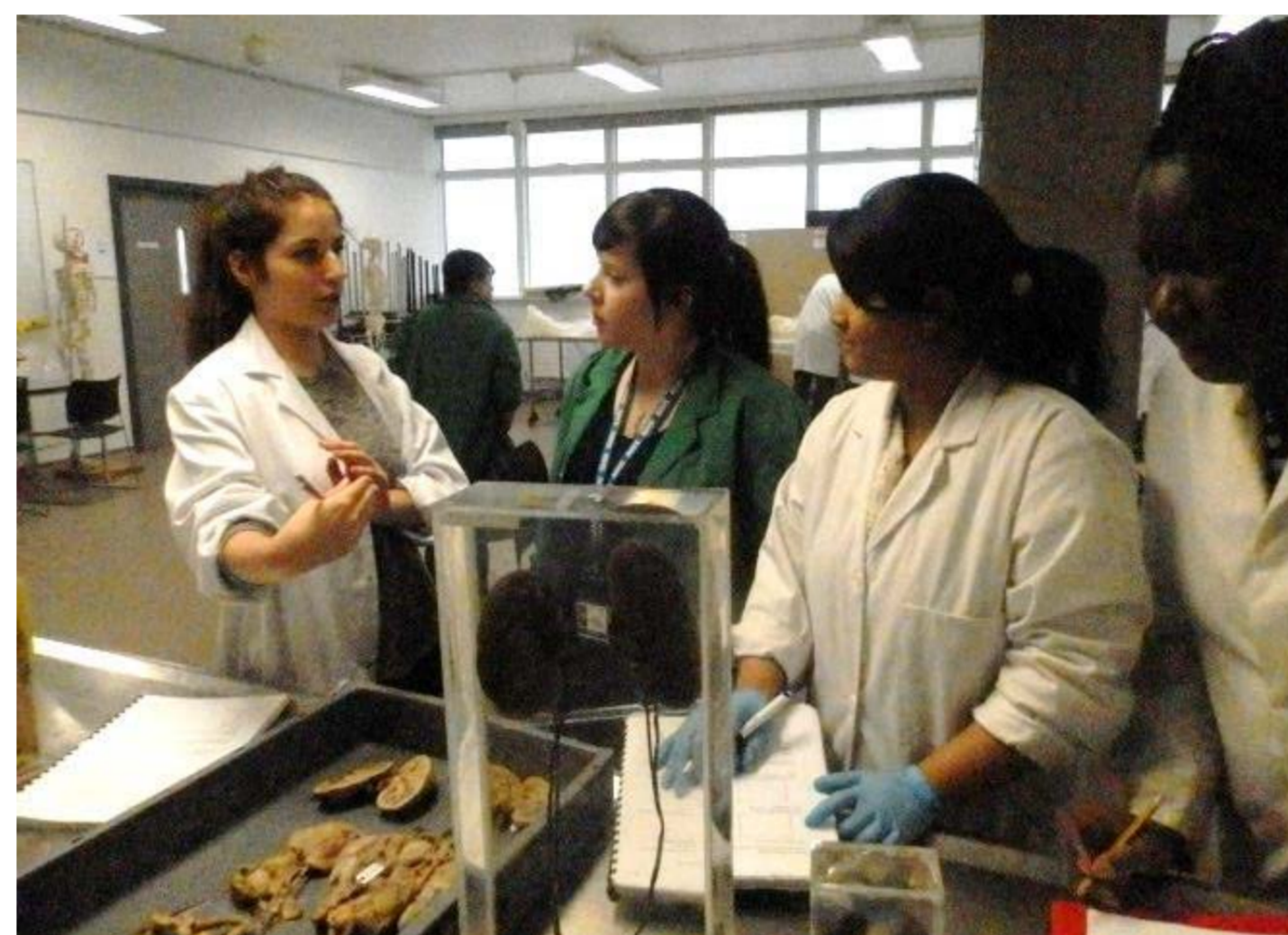
Final Year medical student (in green lab coat) peer tutoring junior medical students.

PALS tutors Transitions "Out": Amongst Year 5 MBChB students (peer tutors) the number who felt that their anatomy knowledge was adequate for the Foundation Programme rose from 44% (11/25) before the session to 68% (17/25) after. Almost all students (21/25: 80%) felt that preparing for the PALS sessions gave them a deeper understanding of anatomical concepts. In 2015-16, PALS tutors were also given the opportunity to apply for recognition through the STAR (Students Taking Active Roles) award 4 , which required participation in 2 skill development workshops, maintaining a record of participation in PALS and attending a competency-based interview. When awarded a silver or gold STAR award this would be recorded on the enhanced student transcript