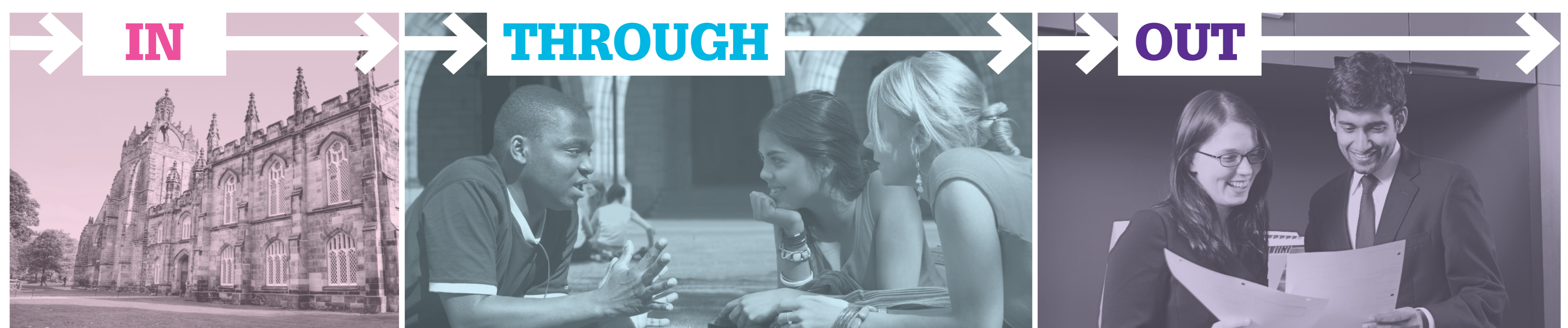
Fig. 1: University Student Transition Model