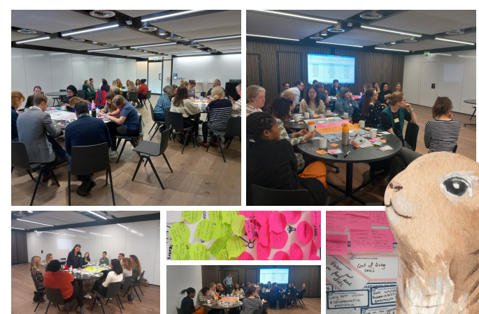
February 16th 2024; NESTA London Office, London