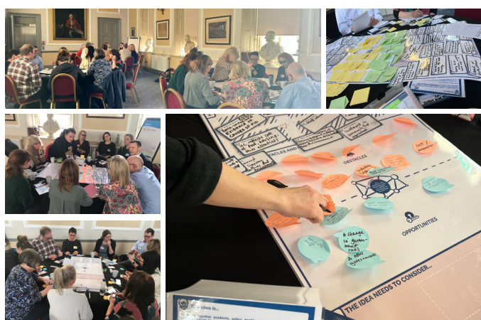
January 30th 2024; Royal Society of Edinburgh, Edinburgh