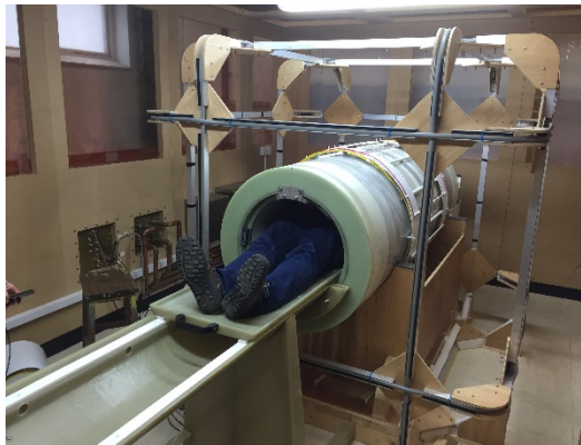
Figure 1: The FFC-MRI system and earth's field cancellation coils.