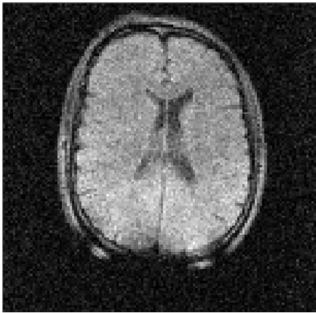
Figure 2: Image from a volunteer's head, obtained at an evolution field of 100 mT.