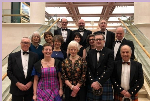
Current and former directors and staff of HERU and HSRU, and colleagues from the University of Aberdeen, at Guildhall