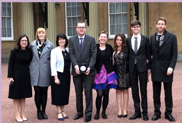
Staff and PhD students from HERU and HSRU outside Buckingham Palace following the award ceremony