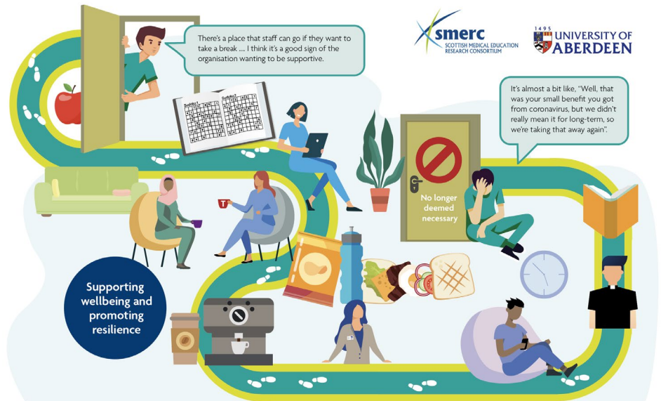
From a study 'To develop evidence-based interventions to support doctors' well-being and promote resilience during COVID-19 related transitions (and beyond)' funded by the Scottish Government's Chief Scientist Office.