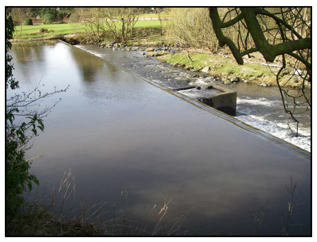
Plate IV: Mid Calder Weir