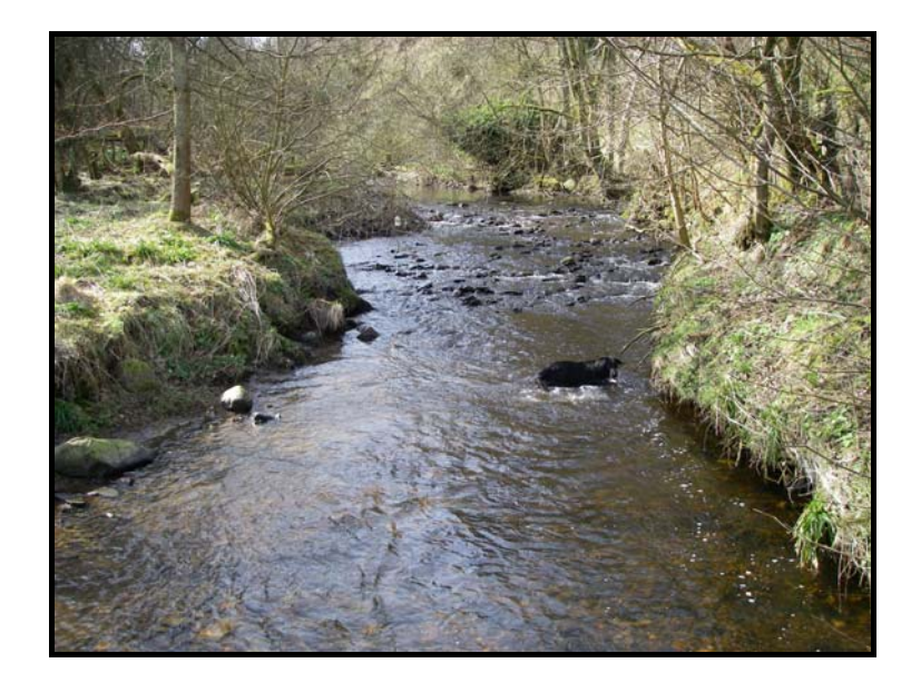
Plate II: Murieston Water (Bog Burn) which joins the Linhouse near its confluence with the River Almond