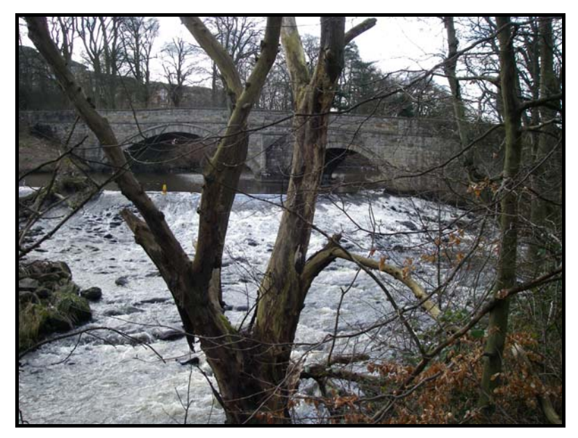
Plate XIV: Weir below Almondvale Flats (a)

The next weir, not far upstream and below an older bridge, comprised a long curved structure with a substantial overall slope and thinly dispersed water coming down it. The full width of the weir is not shown below (Plates XIV&XV)