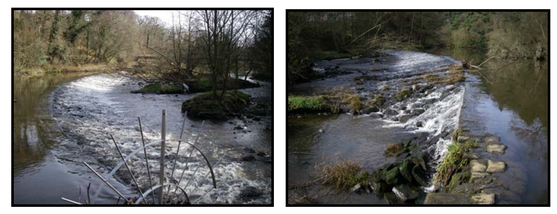
Plates VI & VII: Views of the lower Mid Calder weir and lade

Much of the cobbled, shallow-sloping weir itself appears readily passable by ascending fish in high water conditions, although the lack of a deeper section in the face and the rather broad and shallow water immediately below the weir are unhelpful. Depth could be increased below the weir by removing some of the loose cobbles that have accumulated over time, even using these to back-up a pool beneath. It is assumed that the weir will be retained as a means of supplying water to the canal. Nevertheless, it ought to be possible to dish the face over a short section near the main flow at the right bank to help upstream migration. Increased velocities of water at this point may then scour out a better channel for fish to approach the weir.