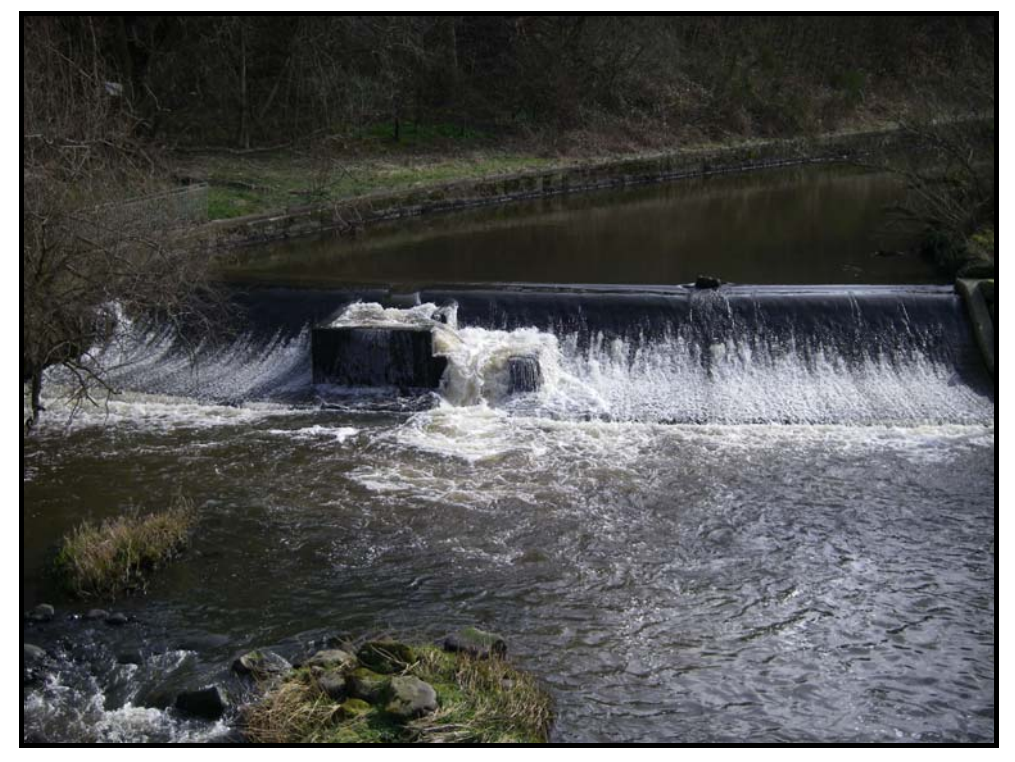
Plate X: Weir at Livingston Rugby Club