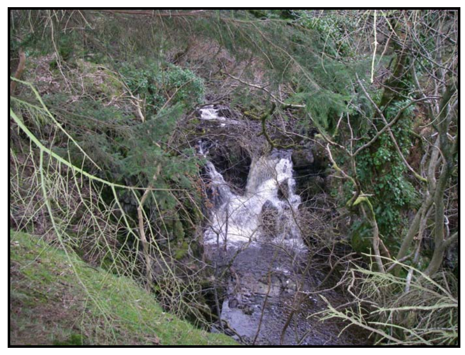
Plate XX: Natural waterfall on Linhouse Water

that could be genetically modified or lost if additional migratory fish are given access. Similarly, stocking of salmon or sea trout could be carried out above the falls but the use of above-falls areas for stocking in order to enhance stocks of migratory fish is seen increasingly as bad practice from a conservation viewpoint.