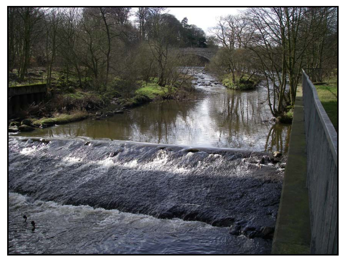
Plate XIII: Weir below Almond Valley Bridge

Further upriver, we inspected a small weir below Almond Valley Bridge where there was no indication of any consideration for migratory fish passage. However, Paul said that fish appear to pass it without difficulty when the river is high, at which times it is almost inundated by the flow. Even so, it ought to have a dished section to assist passage at lesser flows. The most suitable point for this would be at the right bank (not shown), where the flow is already broken by some boulders, although this work would be of a low priority if fish are able to pass relatively easily. However, they then encounter a shallow pool and a difficult run up to the next weir.