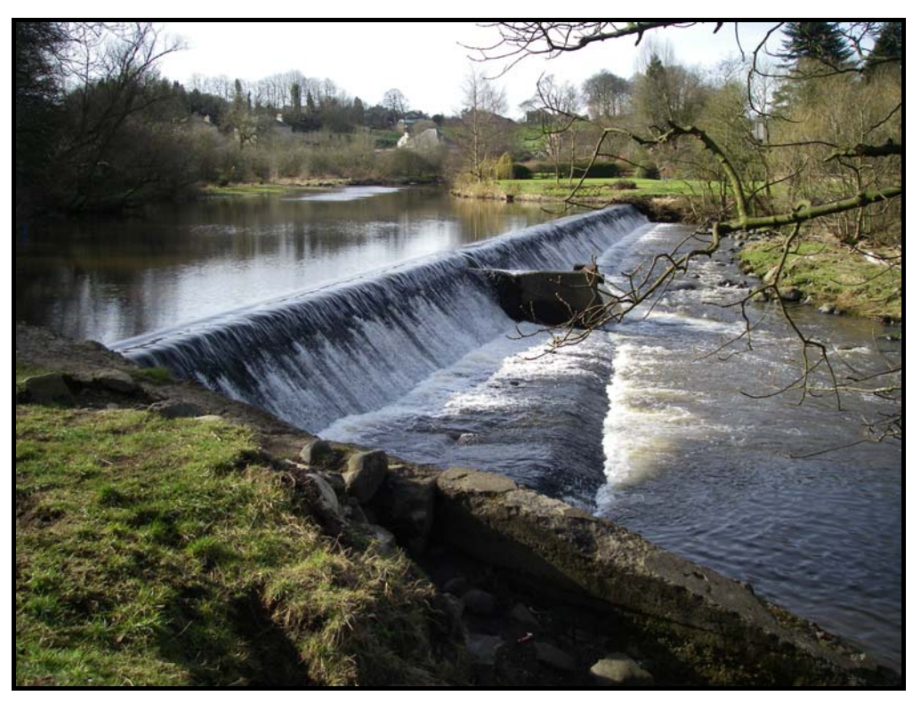
Plate III: Mid Calder Weir