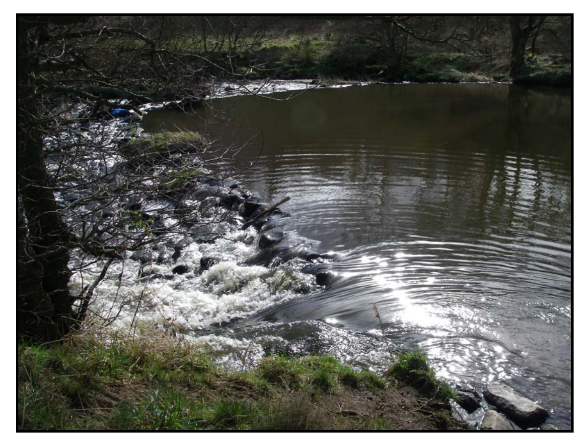
Plate XII: Curved, cobble weir also near the Rugby Club

Another shallow, cobbled weir upstream has a very long, curved span so that the lip is very shallow over most of this length. According to Paul, in the early 1980s, Livingston Newtown Angling Club (also now defunct) tried to remove some cobbles at the top of the weir, but had limited success. However, we found that a section has recently broken through near the left bank and the more concentrated flow in that area has scoured out a deeper channel, making it easier for fish to ascend. This simple rubble weir seems to be breaking down and is not the awkward barrier that it used to be.