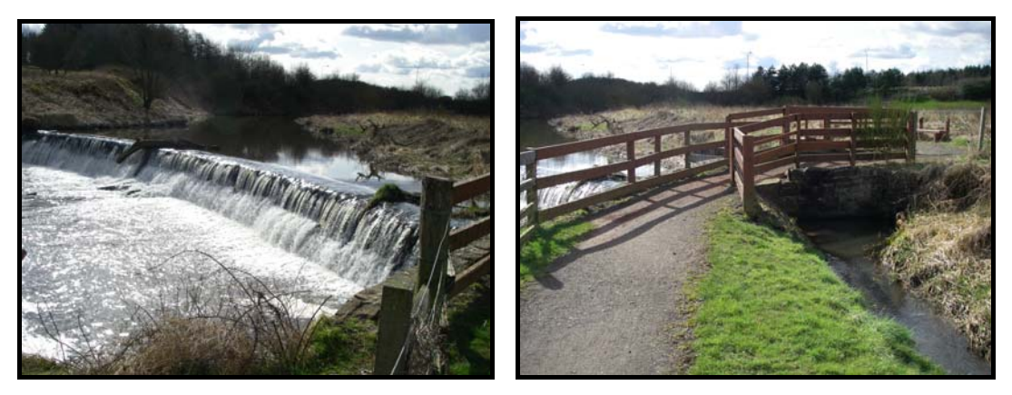
Plates XVI & XVII: Mill Farm Weir and Lade