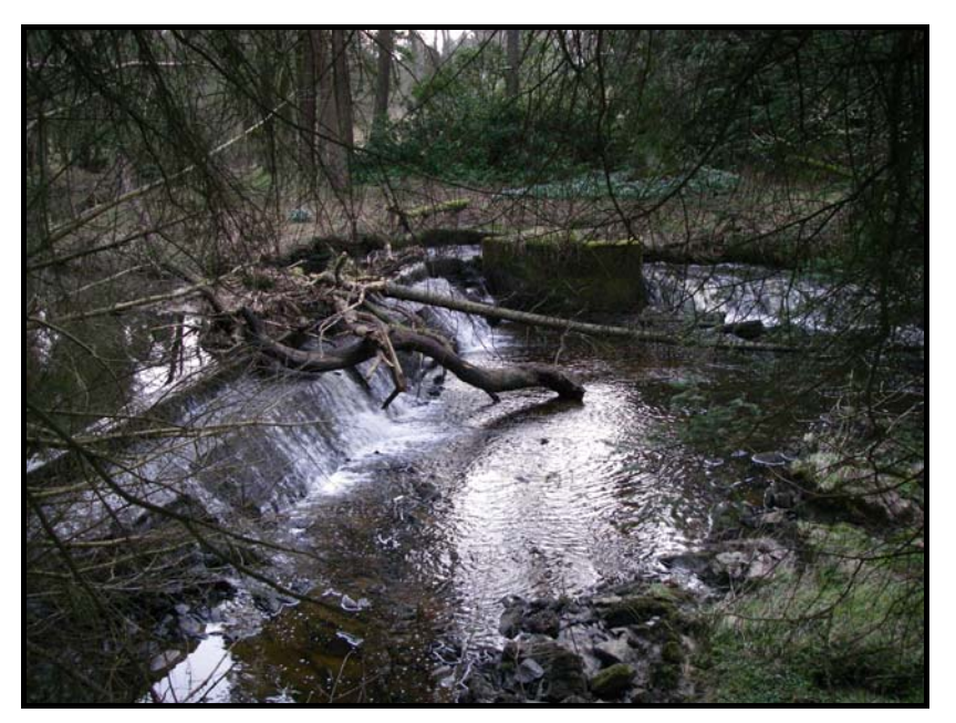
Plate XIX: Derelict weir on the Linhouse Water (upstream of a significant natural barrier)

The complex broken rock shelf at Morton Hall is passed by both salmon and trout and has a number of fissures and other potential routes for upstream-migrant fish to proceed at a range of flows. The concreted top lip, intended to raise the height slightly to help divert flow through a lade on the left bank, is now redundant and could be removed in places, or completely, although it may not affect fish passage at times of reasonable river flow.