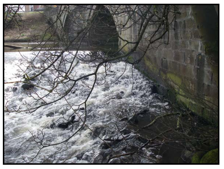
Plate XV: Weir below Almondvale Flat (left bank)

Salmon and perhaps also trout are likely to have difficulty passing this structure, because of the shallow approach and curved crest. Paul said that as far as he knew there have been no reports of salmon caught above this point, although one of the largest tributaries of the Almond, the Breich Burn, is only a few miles upstream. (However, the Breich Burn still suffers from water quality problems due to former mining). The best approach to the weir for migrating fish would seem to be near the left bank (looking downstream) and ideally a slot should be created there by removing some of the crest of the weir close to the bridge. Flow enhancement here should scour a deeper channel immediately downstream and the scouring process could be encouraged if necessary by removing some of the bed during dry weather. Work on the crest of the weir should be done with care in case of damage to the integrity of the foundations of the bridge. However, this modification should be fairly simple to accomplish and should help the fish get past, even though there is a worse barrier not much further up.