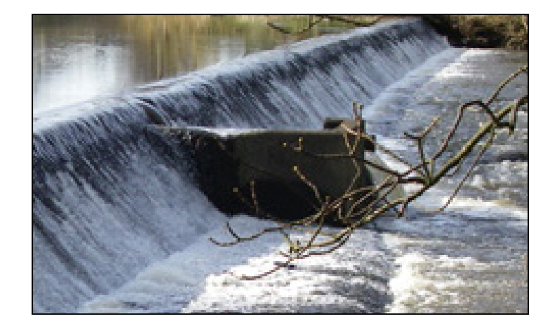
Plate V: Box-type fish pass at Mid Calder Weir (Plate III enlarged)