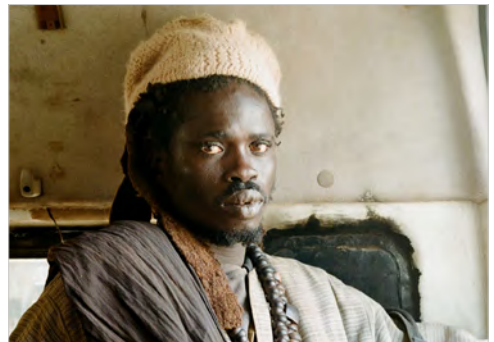
Still from Baye Falls

Baye Falls documents Sufi spiritual teacher Ibrahima Fall , who played an important role during French colonial rule in strengthening the morale of oppressed Senegalese working and lower classes. His teaching prioritised hard work, modesty, and sharing, and Baye Fall ceremonies hold space for indigenous traditions to crossover within Islam.