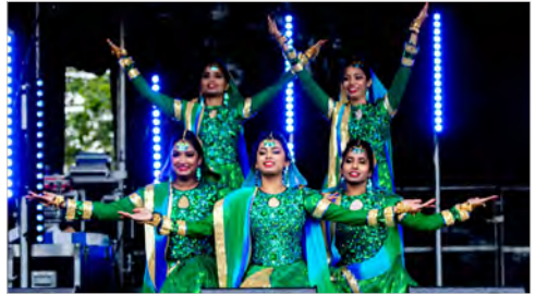
Desi Bravehearts, Mela

Time: 12–6pm | Location: Union Terrace Gardens, Aberdeen