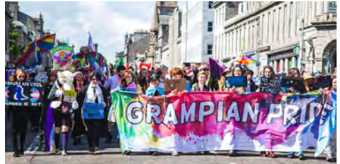
Grampian Pride 2024