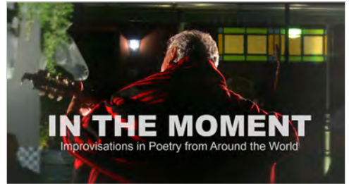
In the Moment poster

Time: 6.30–8pm | Location: MacRobert Building 051