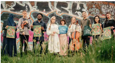
Refugee Festival Scotland