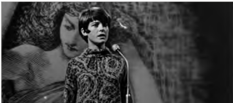
Isla St Clair, 1967

Join us for lunch celebrating the good work of the Friends of the Elphinstone Institute. Renowned singer and presenter Isla St Clair will speak about her career and sing a few songs bringing to light the importance of culture in North-East Scotland. Places will be prioritised for Friends. Enquire for available spaces.