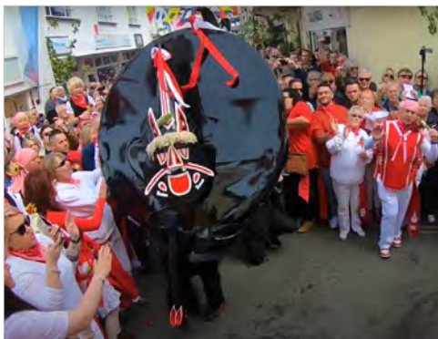
Stills from King for a Day