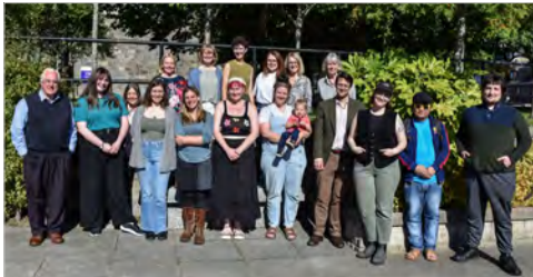
Elphinstone Institute staff and students

Celebrate our 30th anniversary with staff, students, and friends. Visit the Elphinstone Institute , enjoy a glass of bubbly, join in with some songs or tunes, and listen to interesting short talks about all of the excellent work that takes place in the Institute and with the wider community in the North-East and beyond.