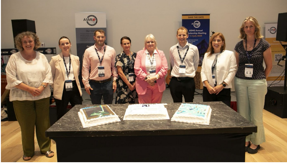
TCT reps with cake