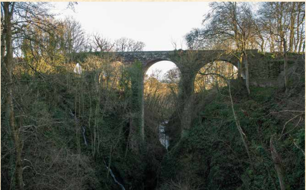
Den of Finella, St Cyrus

"Hush! If his lordship hears ye, ye'll be hanged jist like Finella's son was! Keep this quiet, as far as Malcolm is concerned, the Mormaer's wife died while evading justice. Just pray she doesn't come flying over our nest!" the sergeant hisses as the men mutter. But they know what they saw.